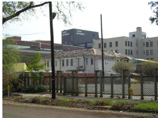
Touro Hospital, in New Orleans, Louisiana

The tactical network enabled the needed connectivity and allowed the IT department time to focus on troubleshooting their hospital network. The network bypassed the IT room and linked the satellite service directly to areas of wired infrastructure in several of the critical areas and created wireless access in all other target areas. This allowed senior staff to focus on restarting hospital operations and the preparation for the treatment of patients with the communications tools they needed. The BreadCrumb® network created connectivity to the emergency room, hospital administration stations, IT hub, and maintenance sections. Temporary Centers for Disease Control operations were established in a medical center building located one block away. Due to the superior range and meshing capabilities of the BreadCrumb® units, the CDC personnel were able to utilize the wireless network from their location as well.