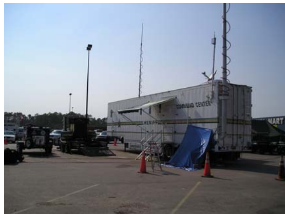
Polk County Command Center in Bay St. Louis, Mississippi